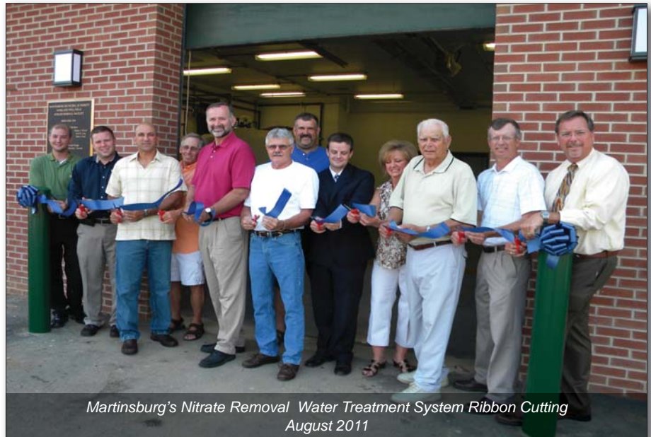
Martinsburg's Nitrate Removal Water Treatment System Ribbon Cutting August 2011

■ Under contract with the Regional Industrial Development Corporation (RIDC) of Southwestern Pennsylvania, LSSE performed a Composite Utility Survey of the Keystone Commons Industrial Park situated in East Pittsburgh Borough, Turtle Creek Borough and North Versailles Township. The survey included location and identification of sanitary, storm, power, and communication manholes and overhead utilities over a 70 acre site.