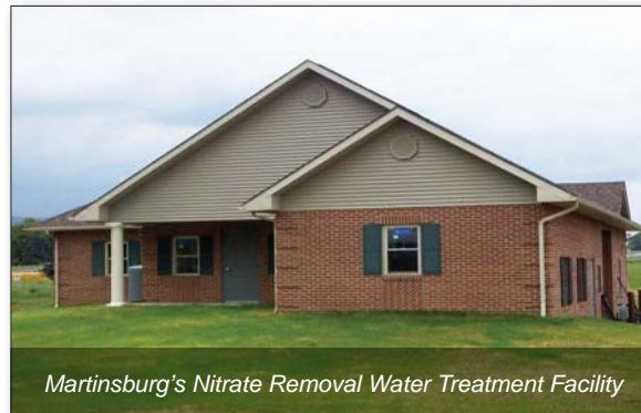
Martinsburg's Nitrate Removal Water Treatment Facility

This Keystone Commons project has also included engineering services for preparation of a Parking Lot Conceptual Plan and design of a truck entrance from Braddock Avenue to South Boulevard at Portal No. 5, as well as engineering services for preparation of a Parking Lot Conceptual Plan and design along Braddock Avenue at Portal No. 7. Services included field surveys, conceptual plan preparation, design services, permitting and preparation of construction plans.