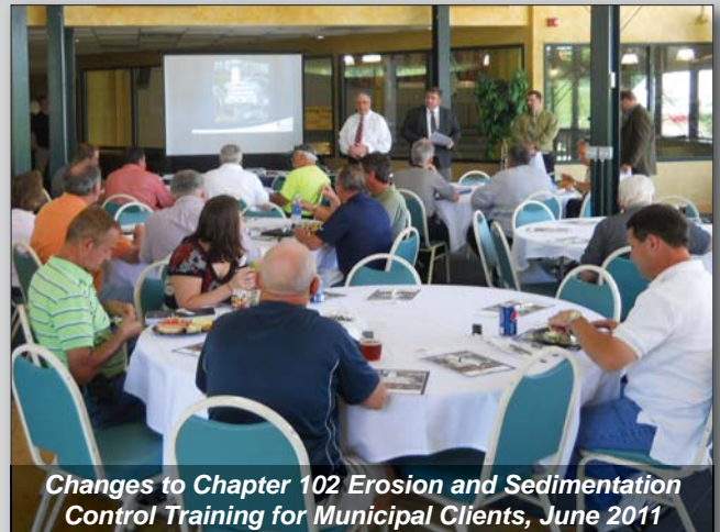
Changes to Chapter 102 Erosion and Sedimentation Control Training for Municipal Clients, June 2011

LSSE routinely hosts and/or participates in continuing education programs, which are necessary to maintain professional licenses and to stay abreast of advances in technology and changes in regulations. In addition, LSSE participates in numerous professional, technical and governmental forums for the purpose of technology transfer and client education. These activities include the hosting of seminars for clients and associates, as well as presenting results of unique LSSE experience in many market sectors. Below is a list of recent or upcoming presentations. Copies of these presentations will be posted on our website at www.lsse.com/lsse-presentations-main.html . We hope you can join us for the upcoming presentations at the 2011 Joint Fall Conference of Townships, Boroughs & Authorities (Seven Springs) as well as the 3 Rivers Wet Weather Conference (Monroeville, PA)!