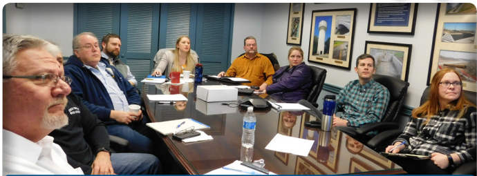
Meeting Attendees : LSSE, Center Township Water Authority, Moon Township Municipal Authority, PaDEP, West View Water Authority, Municipal Authority of the Township of Robinson and RAIN.

A recent source water protection meeting was held at LSSE to discuss source water protection on the Ohio River. Attendees included regional water authorities, including Center Township Water Authority. LSSE is working with RAIN and the Center Township Water Authority to share real-time water quality data from the river intake project currently under construction with RAIN members on the Ohio River. RAIN members include the Authorities of Moon, Robinson, West View, Midland, and the Ohio River Valley Water Sanitation Commission (ORSANCO). Members will use this data to assist in the identification of contamination events and provide data for RAIN to notify member water systems in order to advance efforts in protecting public health and safety, and promote regional environmental accountability.