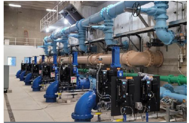
INSIDE CTWA PLANT

The new filtration plant has a capacity of 3 MGD in its current configuration, which will be increased to 5 MGD pending the installation of additional GAC adsorbers and UV disinfection units refurbished from the Interim Filtration Plant. The Interim Plant was formally decommissioned on August 15th, and the new plant's 5 MGD configuration became operational and permitted at the end of 2024.