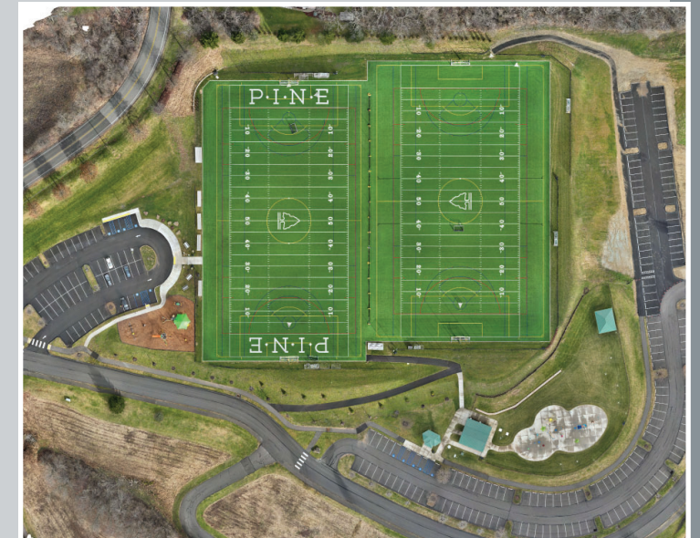
Aerial View of Pine Township Athletic Field

Following is a recent photo from a drone survey that LSSE provided for a client. Stay tuned for more details and future newsletter articles regarding this new service.