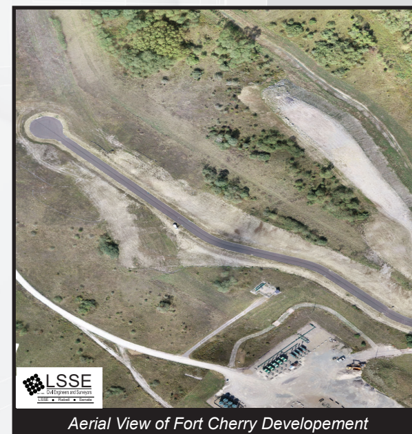
Aerial View of Fort Cherry Development