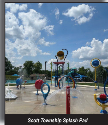
Scott Township Splash Pad

Construction of the Scott Township Splash Pad was completed in May 2024. Located adjacent to the existing pool facilities within Scott Park, Scott Township's new 4,500 sf Splash Pad includes over 30 water features and offers additional recreational space for the area's youth and families.