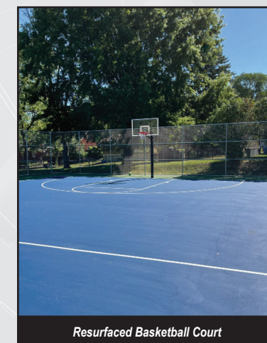
Resurfaced Basketball Court

In June 2024, Scott Township held a ribbon cutting ceremony to celebrate the opening of Scott Park's newest amenities. LSSE was pleased to assist in the design, bidding and construction phase services of both the Scott Township Splash Pad project and Scott Courts Improvements project.