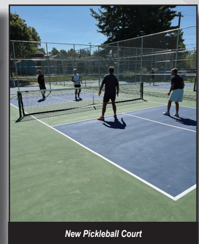
New Pickleball Court