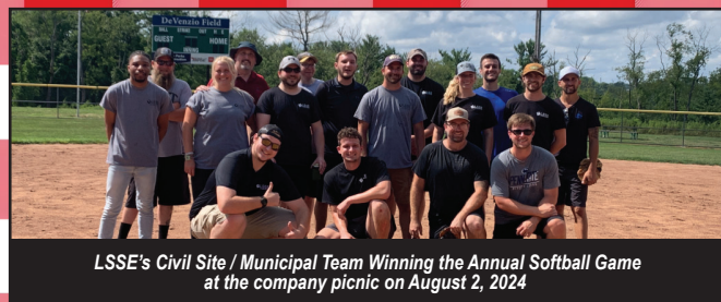
LSSE's Civil Site / Municipal Team Winning the Annual Softball Game at the company picnic on August 2, 2024