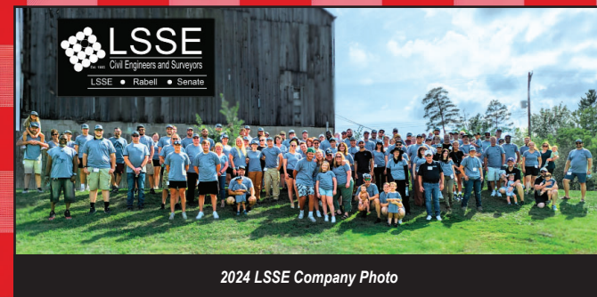
2024 LSSE Company Photo