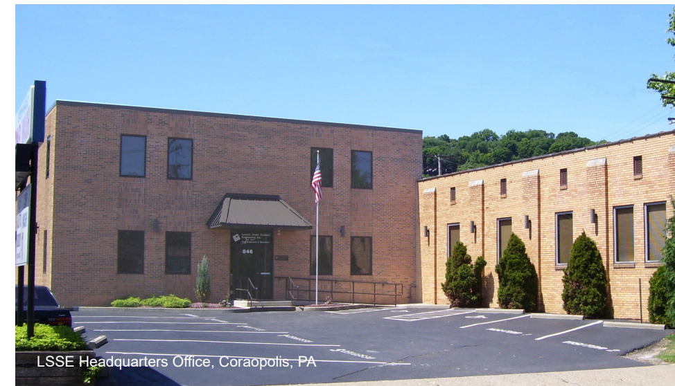
LSSE Headquarters Office, Coraopolis, PA