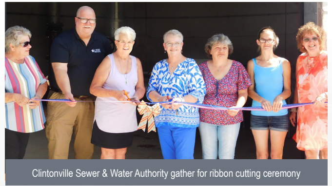
Clintonville Sewer & Water Authority gather for ribbon cutting ceremony